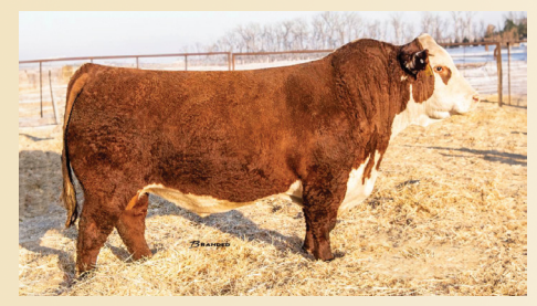
TH MASTERPLAN 183F