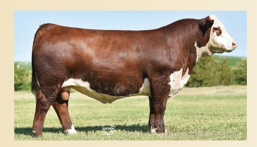
NJW 79Z Z311 ENDURE 173D ET