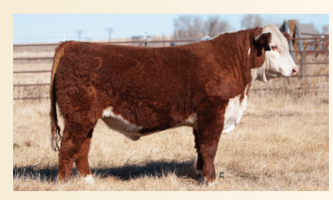
CRR 6589 MANDATE 082