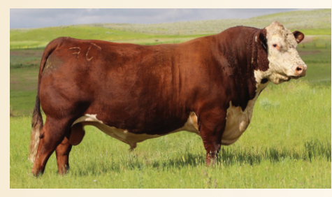
NJW 76S 27A LONG RANGE 203D ET