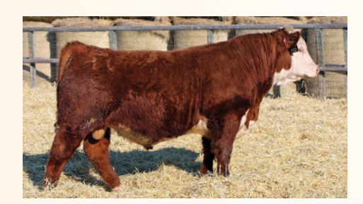
NJW 165A 88X COWCAMP 48F ET