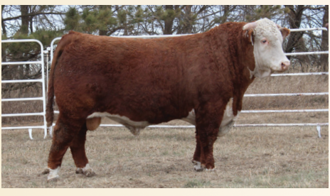
MH FRONTIER 6147