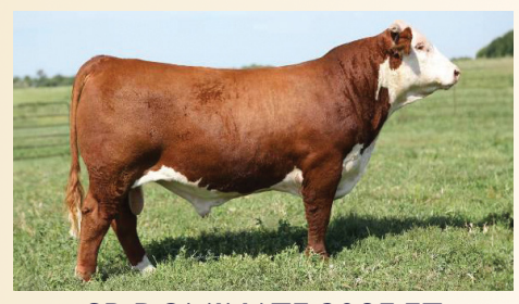
SR DOMINATE 308F ET