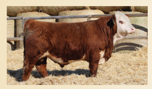
NJW 105F 34F SETTLER 190H