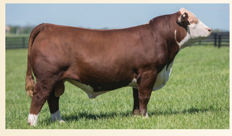
BOYD POWER SURGE 9024