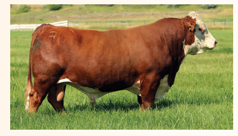
NJW 160B 028X HISTORIC 81E ET