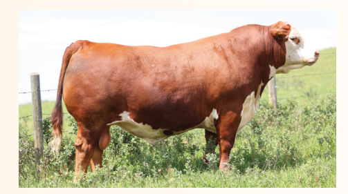
BIG-GULLY 173D FOREFRONT 46J