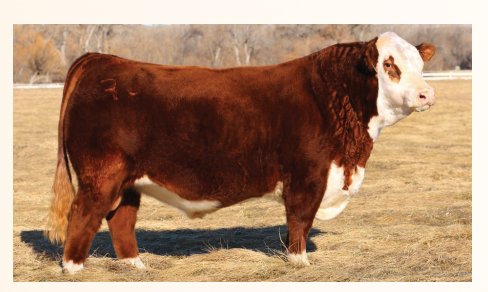
NJW 133A 6589 MANIFEST 87G ET