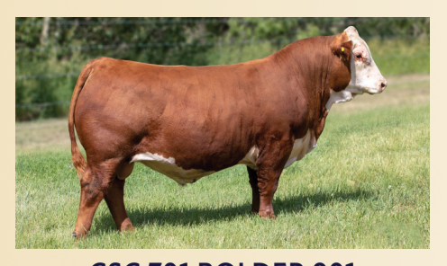
CSC 701 BOLDER 901