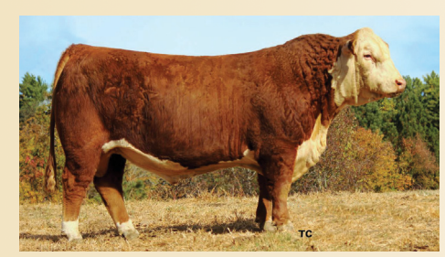
INNISFAIL WHR X651/723 4013 ET